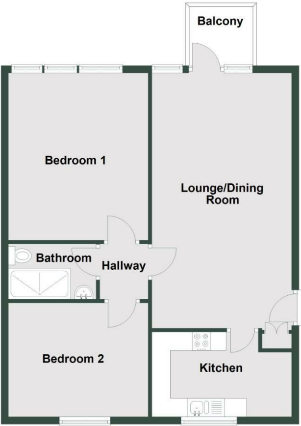
Total area: approx. 71.5 sq. metres (770.1 sq. feet) 3 St Fagans House