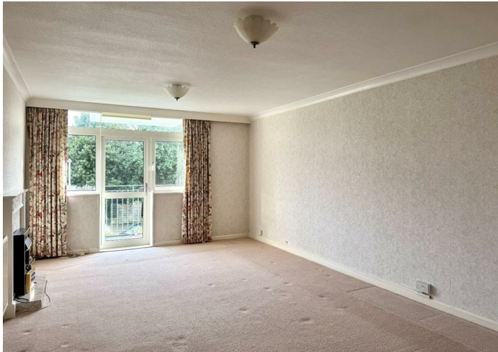
Front door to lounge/dining room.

A spacious lounge/dining room. uPVC double glazed windows facing south with access to a walk on balcony with new powder coated railings. Attractively presented, carpet, period style fire surround, radiator.